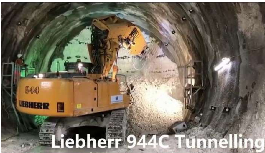
Liebherr 944C Tunnelling

Tunnel construction is one of the toughest operating environments for an excavator to be used in. The operation of a tunnel excavator becomes efficient when the machine, despite the harsh conditions, can cut out the required tunnel profile as rapidly as possible but in economical fashion.